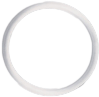
Monthly (EluRyng or NuvaRing)